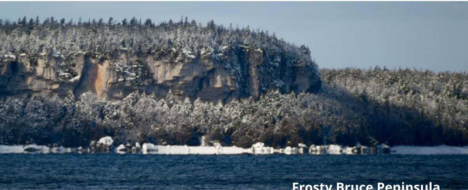
Frosty Bruce Peninsula