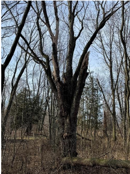
A large dead maple, overhanging dead branches pose a risk to trail users.