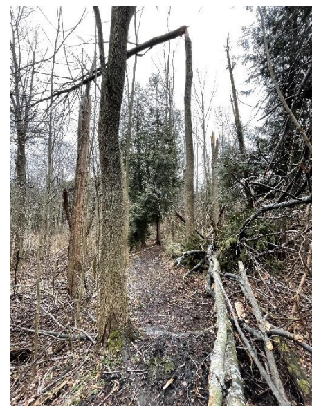
Overhanging dead ash – broken top on tree now overhangs trail, posing significant risk to trail.