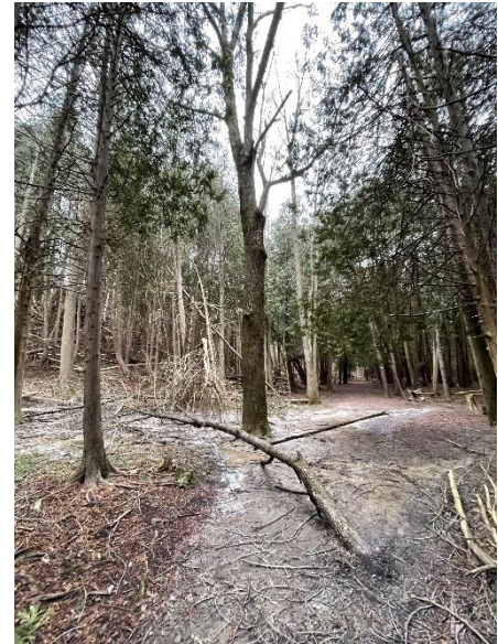
A large limb that fell from the canopy and embedded in the ground. Fallen limbs can cause “struck-bys” which can cause severe injury or death.