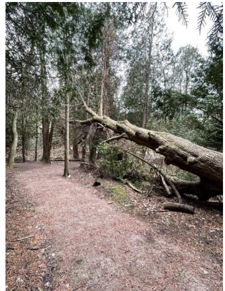
Large fallen dead ash - tree fell next to trail and is now overhanging at top.