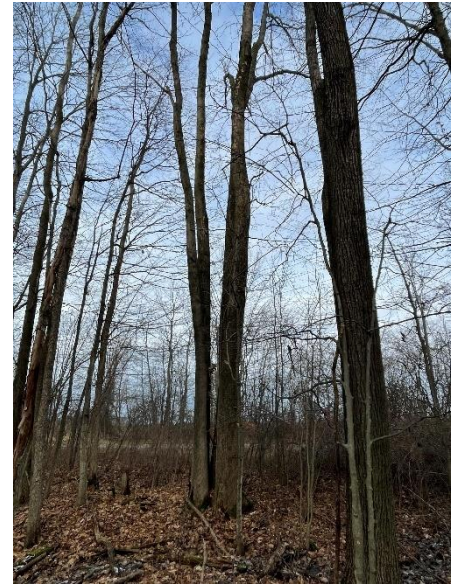
Dead ash tree – Power lines on north side of tree – tree must be removed in sections to avoid damage.