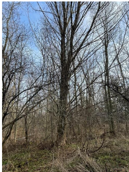
A large dead ash which has a slight lean toward trail – if tree fails it will pose a significant risk to trail users.