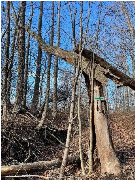
Dead ash tree – snapped off near base – tree now hung up and pointing back towards trail.