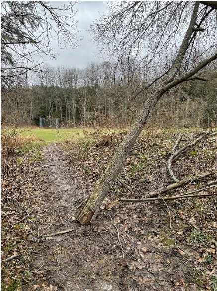
Another large limb that fell from the canopy and embedded in the ground and the location in the tree that it fell from. Several large dead leaders remain overhanging the trail.