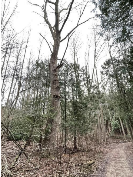
A dead ash tree - shows severe decay Dead overhanging branches pose risk to trail users.