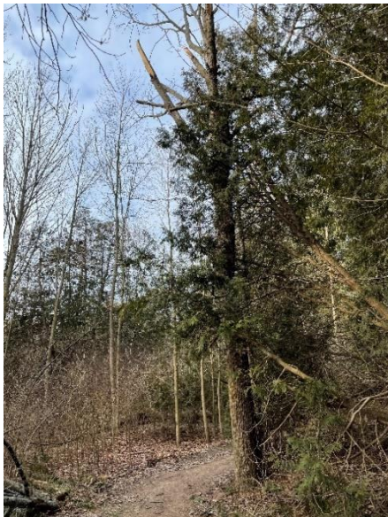
Large dead ash – tree has already lost limbs in canopy and is left with a large spiked limb that could fall on users.