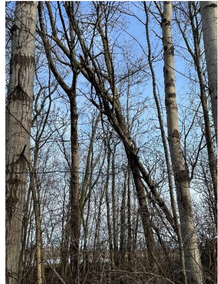
Uprooted poplar that has fallen and has become hung up amongst other trees and now overhangs the trail.