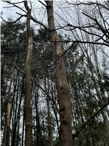
A large dead ash – showing severe decay, located directly beside trail posing significant risk to trail users.