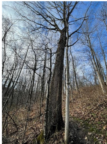
Dead ash tree – consistent size with the majority of trees that fall into Category 2