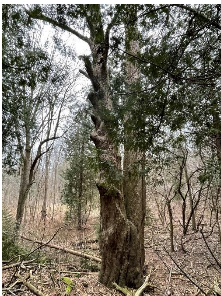
Large dead tree – heavy lean toward trail, has lost limbs previously.