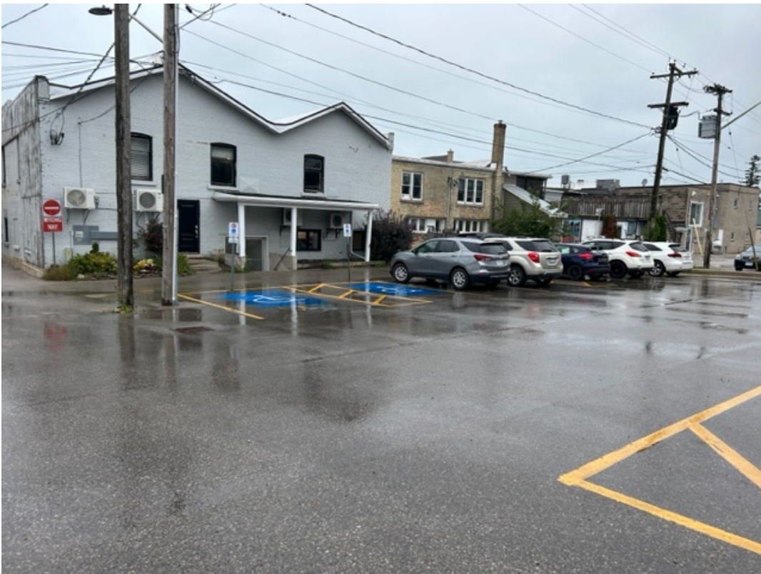
In picture two I'm not sure if this is municipal. I feel there may be in adequate lighting