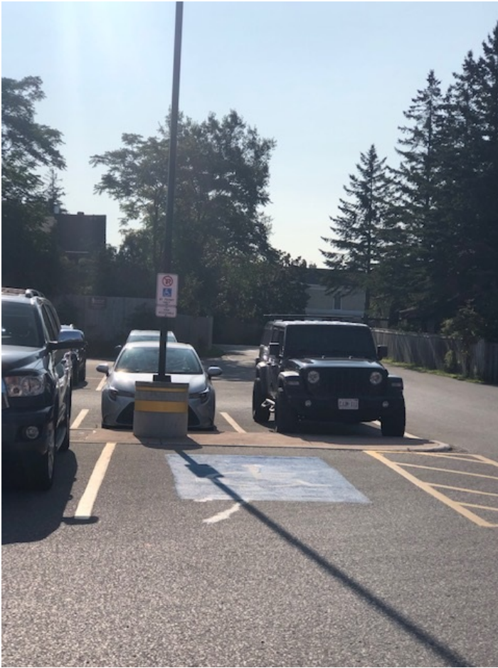
AAC – Good location and paint