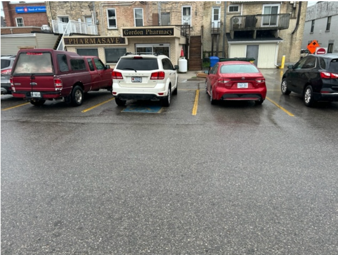
Scott - In picture one I feel this spot behind Gordon's requires two spots