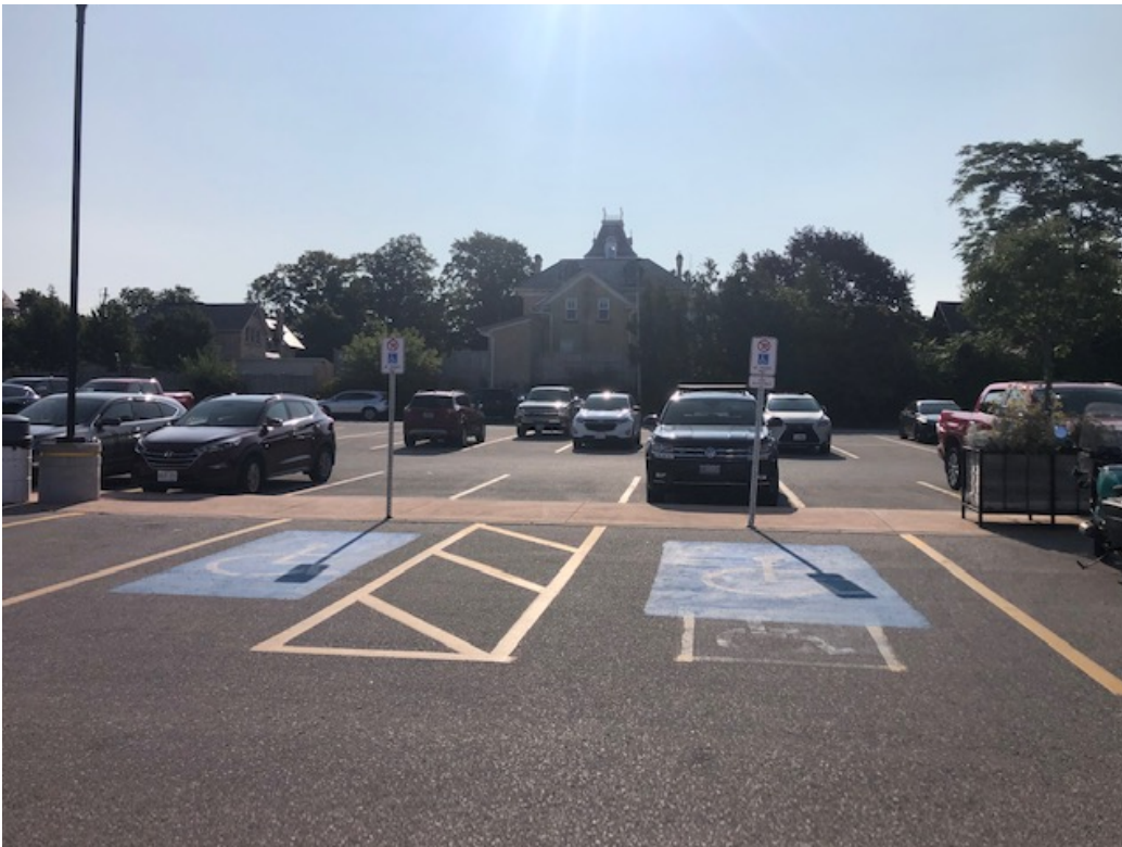
AAC – good location and paint, provided they meet minimum width