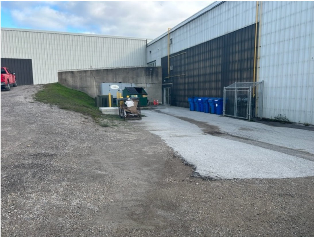
Scott – recommends this entrance be converted to an accessible entrance with 2 accessible parking spaces. Leads to pool and hall