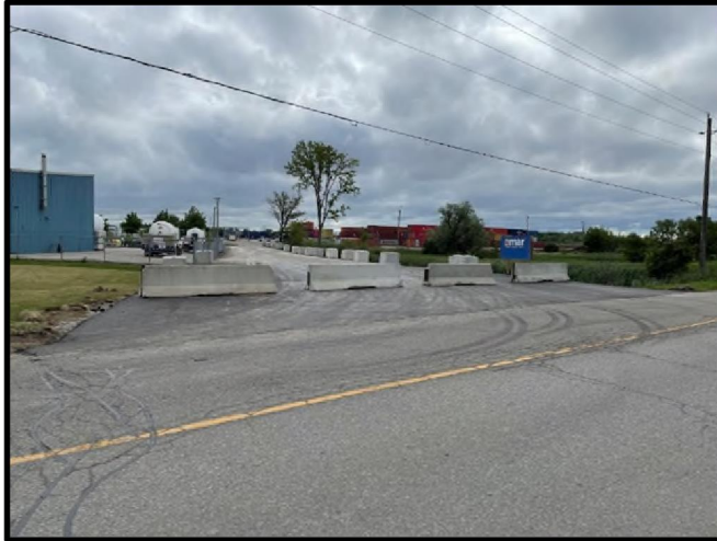
Figure 2: Example of physical enforcement action

Along with physical actions being taken such as the placement of barriers or removal of illegally placed fill, another action undertaken to help reduce the cost advantage of operating illegally has been to inform the Municipal Property Assessment Corporation (MPAC) through Finance staff of changes in use of the property and have the property reassessed. Often, illegal operators are surreptitiously converting farm properties to commercial properties and by informing MPAC of the actual use of the property appropriate taxes can be levied, ensuring equal treatment for legal and illegal operators. To date there have been 25 properties reassessed and this has resulted in more than a $384,000 increase in the tax levy for these properties; another 24 properties are still waiting to be reassessed. Staff also regularly inform our contacts at the Canadian Revenue Agency (CRA) of these operations as we have found that there is a significant amount of cash transactions between the vehicle operators storing their vehicles on the property and the operators of these yards. Staff also regularly communicate with other enforcement agencies such as the Toronto and Region and Conservation Authority (TRCA), Ontario Ministry of Transportation (MTO), Ministry of Environment, Conservation and Parks (MECP), and the Electrical Safety Authority (ESA) on these illegal operations and coordinate our enforcement efforts with them as much as possible.