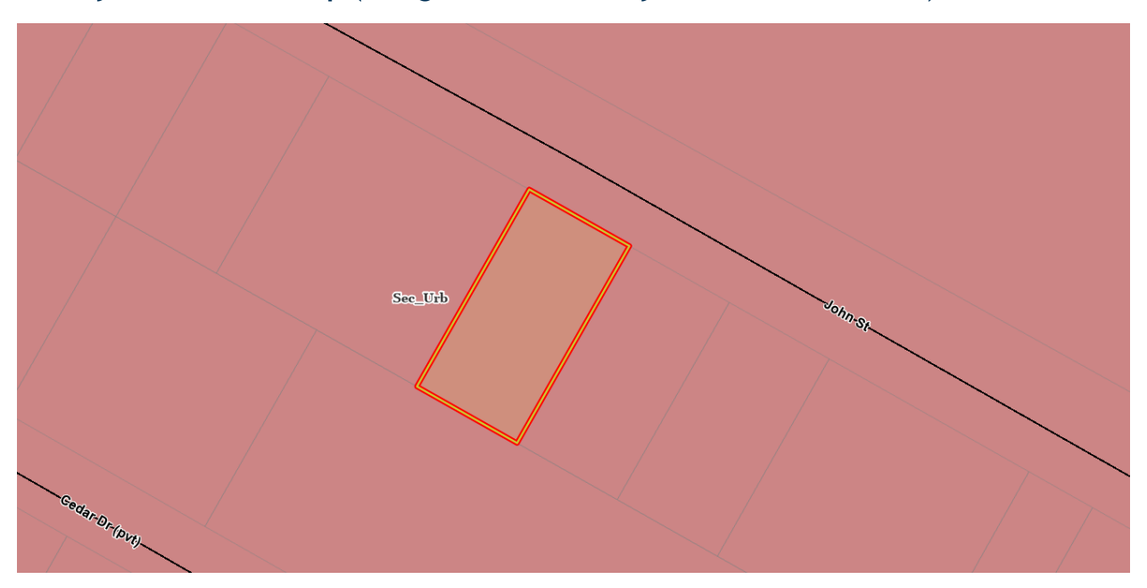
Local Official Plan Map (Designated Shoreline Development)