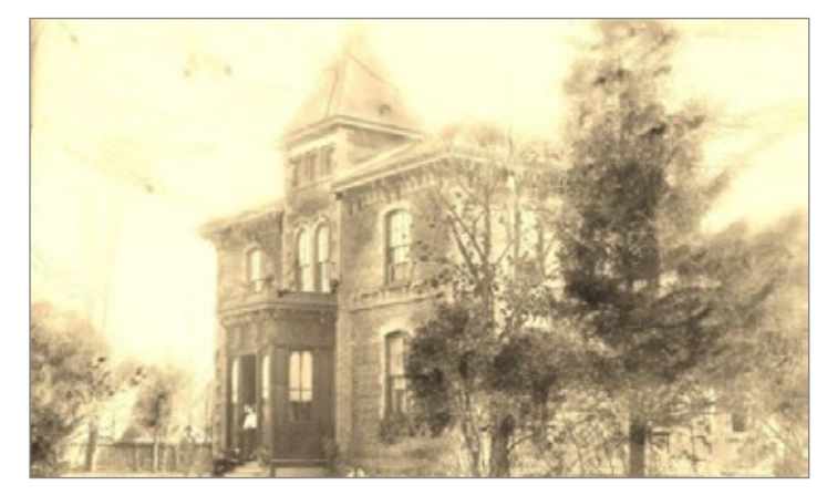
Stratford White House c.1890s

There have been major controversies about this property over recent years. The house sits on a deep and wide lot (210 feet/64 metres of frontage) spanning the block between two side streets, so the owner applied to sever 3 building lots. He faced protracted opposition from a vocal and organized neighbourhood group. The issue ended up at the Ontario