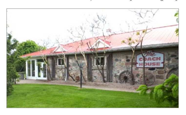
The Coach House (above) and St. Peter's (below)

At the St. Joseph Settlement Memorial we were able to walk the grounds. In Zurich, Ontario we visited St. Peter's Lutheran Church, the Lutheran Pioneer Cemetery and Hay Hall. St Peter's Lutheran Church houses the Hess Clock—a three-sided clock in the church tower that is wound once a week and still chimes hourly. There are only three such clocks in Canada that still operate as they were originally