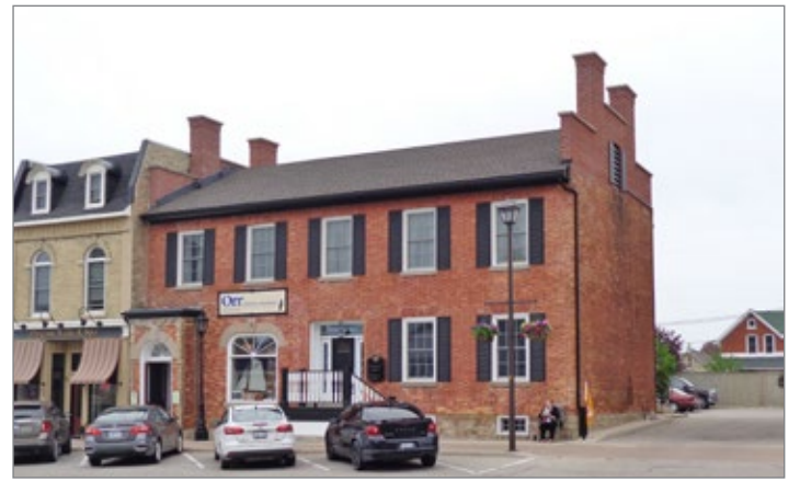
Reconstructed 50 West Street, Goderich Photograph: Wayne Morgan, 2019