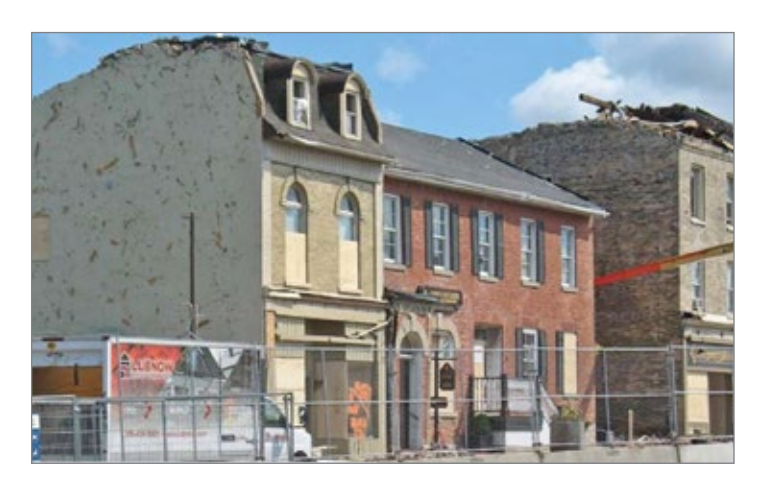
Partially damaged 50 West Street, Goderich