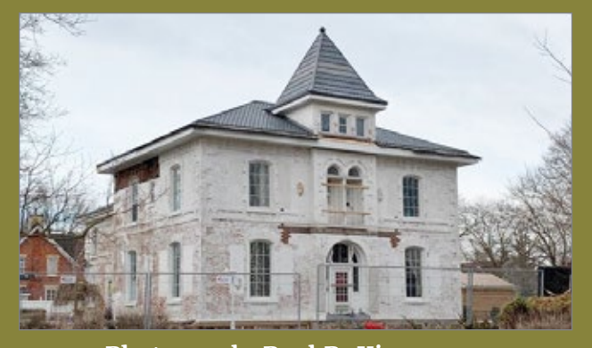
Photograph: Paul R. King, 2019