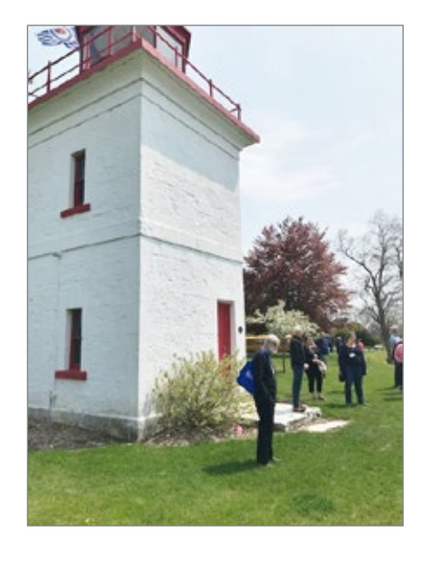
Guided Tour of Marine Harbour