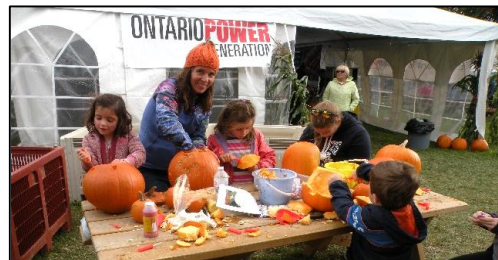
Port Elgin Pumpkinfest