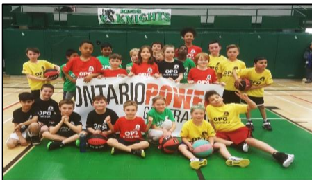
OPG Basketball League