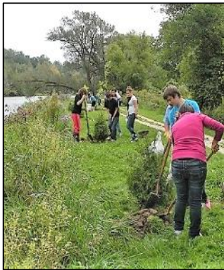
SVCA Tree Planting