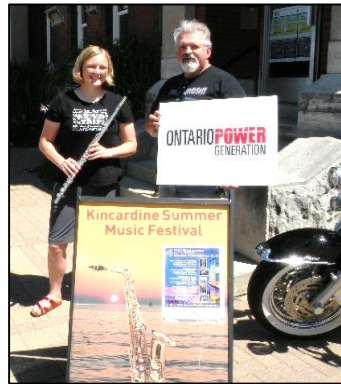
Kincardine Music Festival