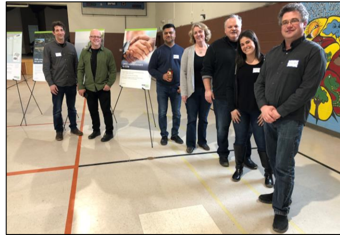
OPG staff at SON Community Engagement Session