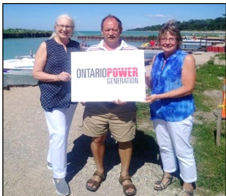
Point Clark Boat Club Restoration