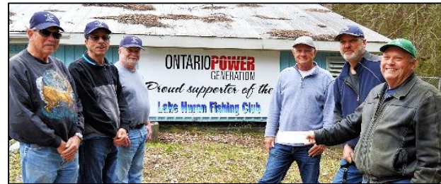
Two local fish hatcheries