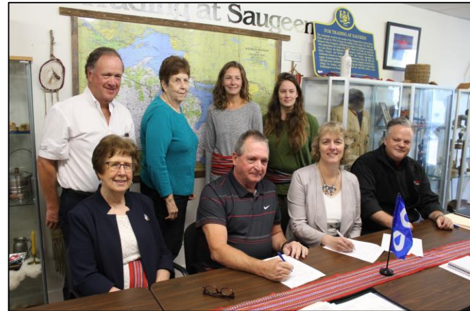
OPG and HSM signing a Long-Term Agreement