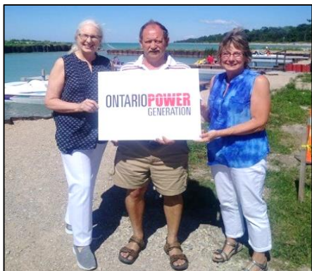
Point Clark Boat Club Restoration